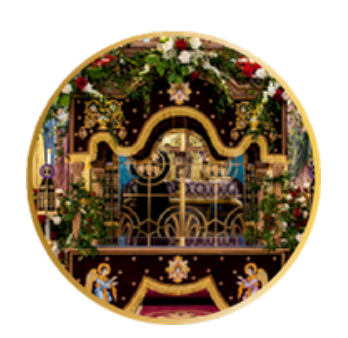
Donate Flowers for the Epitaphion