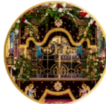
Donate Flowers for the Epitaphion